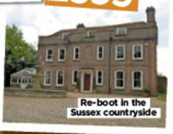
Re-boot in the Sussex countryside

Staying in a beautiful Georgian house in the idyllic Sussex countryside, guests are re-educated on the impact of processed food, and how it affects our diet, weight and wellbeing.